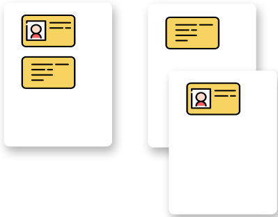
Separate sheets in the same PDF

Scan both sides of your ID in color. The information and photo of the candidate must be legible.